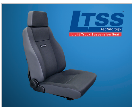
The 3000 LTSS seat in Charcoal coloured trim

The 3000 LTSS features the ergonomically contoured 3000 series backrest. Energy absorbing mesh in the base reduces driver fatigue and increases comfort.